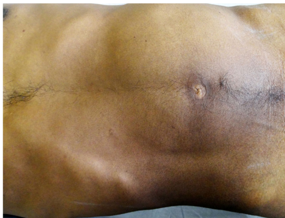
Fig. 1 Swelling occupying whole of the left side of the abdomen

The patient posed to us a diagnostic dilemma and we were unable to reach a definite diagnosis even after extensive investigations. The patient was planned for exploration with a probable diagnosis of pancreatic pseudocyst or lymphangioma. The patient was operated