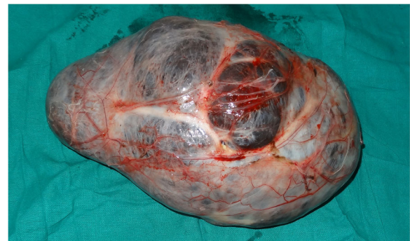
Fig. 3 Excised specimen retroperitoneal cystic mass of size 25 × 15 × 15 cm

on February 2018, on exploration, and there was a cystic mass of size 25 × 15 × 15 cm (Fig. 3), which was present in the retroperitoneum pushing the small and large bowel loops anteriorly and to the right. The ureter and gonadal vessels were compressed posteriorly by the mass. Cranially, it was pushing the stomach and