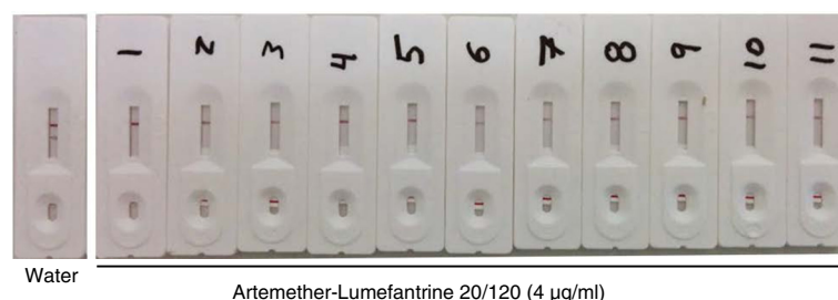
Fig. 2 Artemether/lumefantrine (20/120) samples tested in PNG showing that all tested drugs passed the tests. Drugs tested include Artefan (1–3 and 5–8), Lumartem (4), Coartem (9 and 10), and Coatal (11). The order of the dipsticks shown here is the same as the order listed in Table 1 for the artemether/lumefantrine drugs tested in PNG

Additional evaluations using slight variations of the protocol also were performed in different field sites. In PNG, when initial drugs (artemether 20 mg/lumefantrine 120 mg) were dissolved in 10 ml of water as stock solutions, diluted in water to \sim 2\ \mu\text{g/ml} , and tested on the artemether dipstick, the test line in the dipstick showed a faint band compared to the complete disappearance that occurred when the same drugs were dissolved in alcohol per instruction. This result is consistent with the poor solubility of artemether in water. At the Colombian site (Buena Ventura, Valle), investigators also applied the same CoArtem® 20/120 drugs on