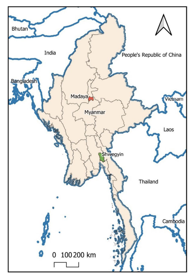
Fig. 1 Map of Myanmar with study sites; Shwe Kyin in Bago Region and Madaya in Mandalay Region

The Department of Medical Research (DMR) and the NMCP under the Ministry of Health in Myanmar coled the fieldwork for this study. Thus, this study demonstrated the collaborative effort of different departments, with the integration of three national programs through midwives to detect malaria, anemia, STH and HIV in rural settings in Myanmar.